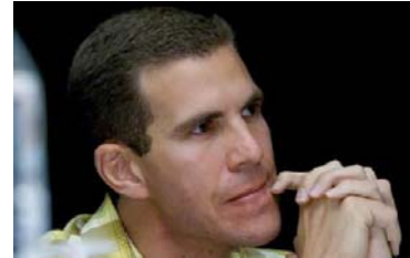
Former Billabong C.E.O.