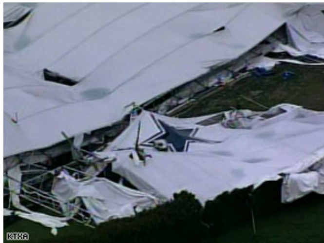
The Ruins Of The Tent

A deadly thunderstorm which occurred during the Cowboys' football training camp has left one member of the squad permanently paralysed. The canopy in which the team were practising in yesterday afternoon collapsed due to high winds and heavy rain. Rich Behm, 33, was one of the many Cowboys team members in the canopy when it collapsed. Behm unfortunately suffered a broken back, and broke several vertebrae. Leaving him permanently paralysed from the waist down.